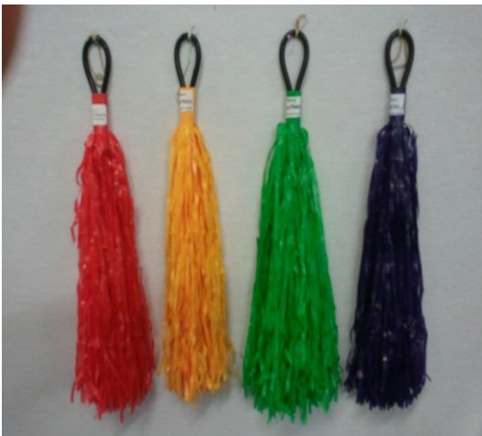
POM POM SHAKER – RED, GREEN, PURPLE, GOLD