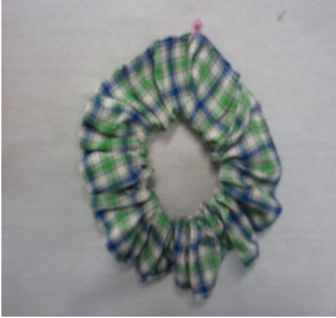
HAIR SCRUNCHIE - GREEN TARTAN CHECK