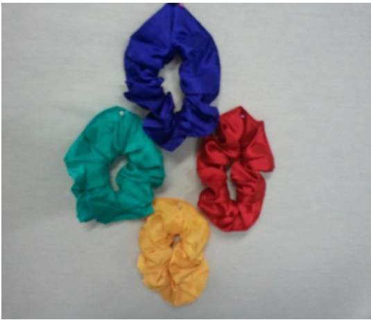
HAIR SCRUNCHIE – RED, GREEN, PURPLE, GOLD